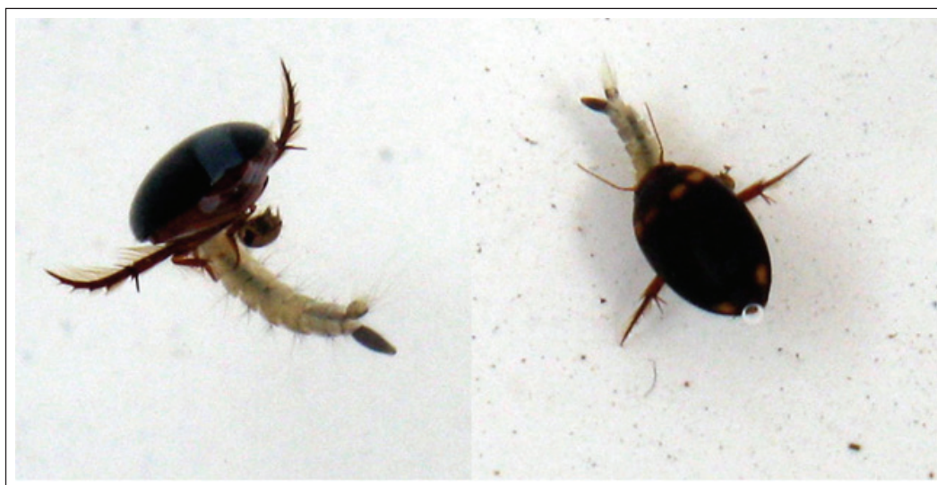
Figure 2. Adult specimens of Platynectes sp. feeding on Aedes albopictus larvae in laboratory conditions

LCC was recorded to be 49.45, one day prior to release of beetles. In the LCCs where 8 beetles were introduced, none of the larvae could survive on the 4 th day post-release (Fig. 3). Ae. albopictus larvae thrived in LCCs where in four and two beetles were introduced until 8 th and 9 th days respectively. A significant reduction in larval densities ( p = 0.0017 and 0.0043 for 8 and 4 beetle releases respectively) was observed on the first day post-release. However, with two beetles, a significant reduction ( p = 0.0025 ) in the larval density was recorded only from