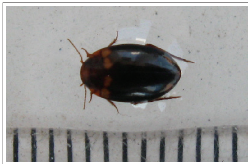
Figure 1. Platynectes sp. adult specimen (The divisions in the scale shown below equals 1 mm)

To estimate the maximum number of Ae. albopictus larvae a beetle could devour per day, two independent experiments (in triplicates) maintaining negative controls were performed in the laboratory by introducing (i) one beetle in an enamel tray